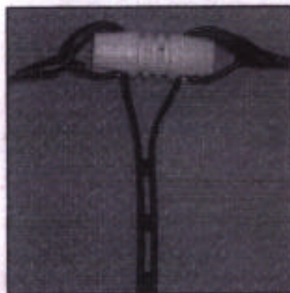
Photo D. Connection of twinlead to inner antenna wires at center of antenna.

When you're ready to proceed, do the following: