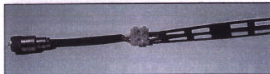
Photo E— Connection of twinlead to coax. Short length of coax section is for illustration only. All connections should be weatherproofed with shrink-tubing, CoaxSeal®, or similar.

conductor at least 25 ft. high. Mine is installed in a horizontal plane; however, others have installed the 'GI antenna as an inverted-Vee and are getting excellent results. Table I shows the typical SWR results for this antenna.