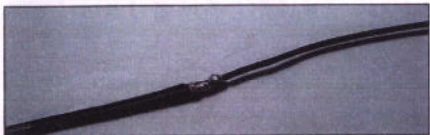
Photo C— Connection of outer end of coax section (farther from center). Note that both center conductor and shield are connected to the wire.