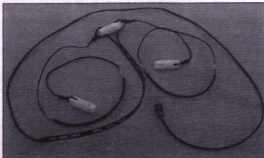
Photo A— Full view of the W5GI Multiband Mystery Antenna, with all sections shorted considerably for illustration.