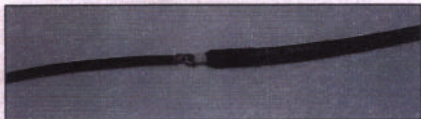
Photo B— Connection of inner end of coax section (closer to center). Note that only the center conductor is connected to the wire.